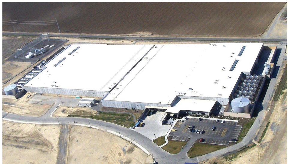
Microsoft Datacenter in Quincy, Washington